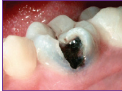
Major tooth structure lost