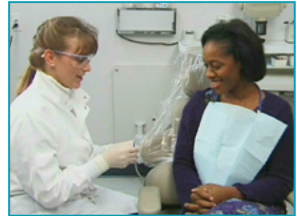
We'll explain proper techniques

When you've lost bone due to periodontal disease, it takes new tools and techniques to clean the plaque off of your teeth.