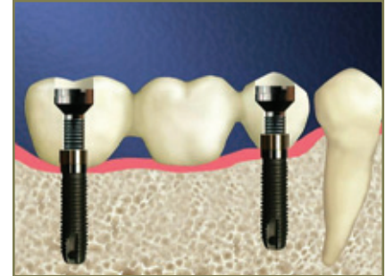
Bridge is placed