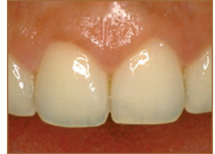
An improved smile

Gingivectomy, sometimes called gum reduction surgery, is a safe and predictable procedure for removing excess gum tissue from the front surface of the teeth.