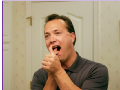
Brush and floss normally