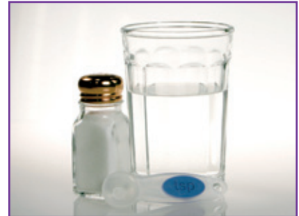
Use salt water rinses for soreness