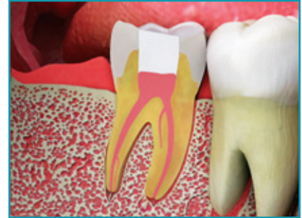
Root canal treatment saves your tooth