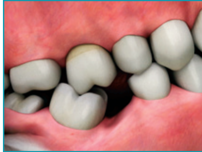
Teeth need each other for support